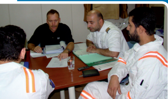
Reviewing the Safety Management System