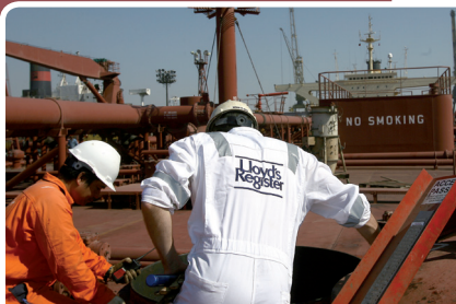
Maintenance and inspection routines