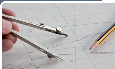
Keeping charts up to date