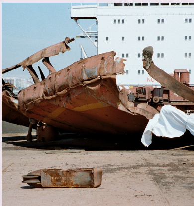
The damage caused by a DRI explosion

Wood products transported in bulk are listed in a new schedule to the Code: Wood Products – General. They include logs, pulpwood, roundwood, saw logs and timber. These cargoes may cause oxygen depletion and increase carbon dioxide in the cargo space and adjacent spaces.