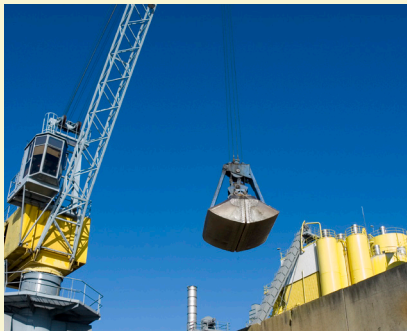
Cargo being worked