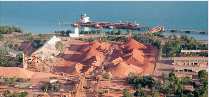
Bauxite ready for loading in Australia

The IMO is currently investigating the risks associated with Bauxite; the conclusions may result in amendments to the Code.