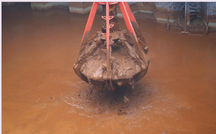
Liquefied nickel ore

You can find the Group for a particular cargo in its schedule.