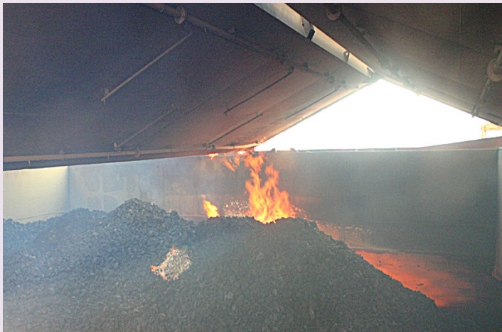
Coal on fire in a cargo hold