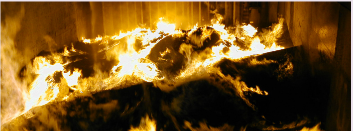
DRI which has self heated

Corrosion can be caused by some Group B cargoes and their residues. A coating or barrier may need to be applied to the cargo space structures before loading. Before loading and unloading corrosive cargoes, make sure the cargo space is clean and dry.